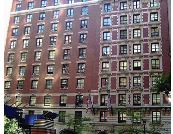
Special needs housing in New York, NY

The outcome of this effort has been impressive: residents spend 50 percent fewer days per year in psychiatric hospitals, make 58 percent fewer visits to emergency rooms, and are four times less likely to face medical issues.