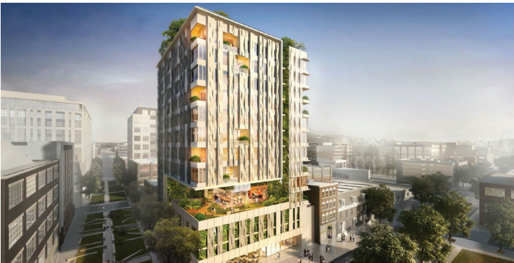
Multifamily housing in Portland, Oregon

The vast majority of apartments in America are rental, although condominiums and co-ops are apartments that can be purchased.