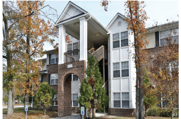
Senior rental housing in Charleston, SC

Management often acknowledges some residents will be living alone and tries to provide activities to combat loneliness. Some provide residents services that can include health assessments, access to in-home services from outside vendors and transportation. Some of the communities encourage residents to provide support for each other. As people age, many lose long-time friends who have either relocated (often to health-oriented facilities) or passed on. Adult children have work and family responsibilities and are not always able to put in the time they would like to share with their parents. Good senior housing management addresses these issues.