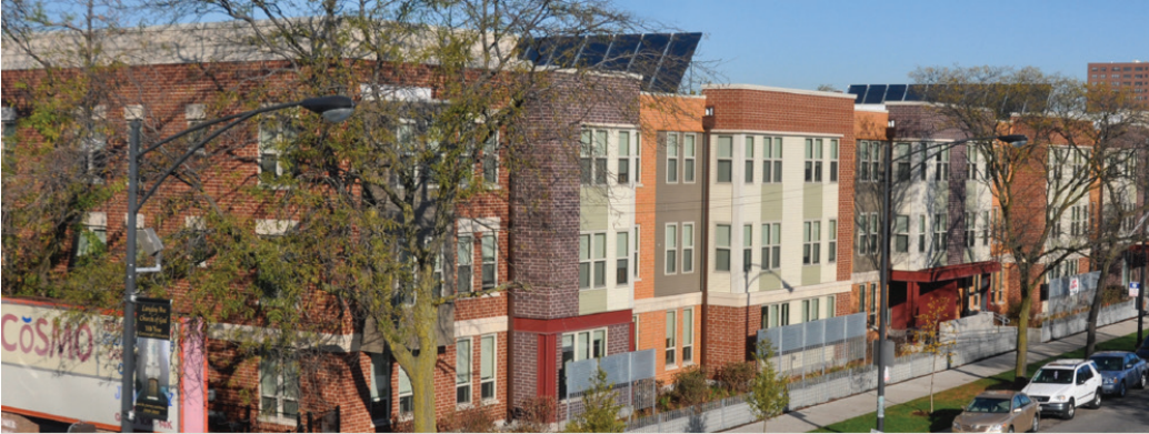
Affordable housing on Chicago's South Side

Affordable senior housing is most often government program-supported, is limited to those who meet income qualifications and often has extremely long waiting lists.