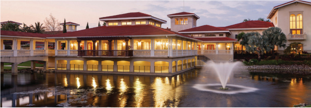
CCRC in Palm Beach Gardens, FL

CCRCs are the high end of senior living options both in services provided and costs.