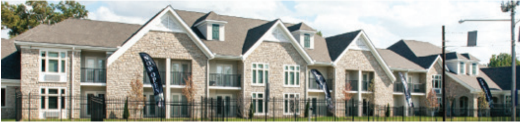
Assisted living in Columbus, OH

Assisted Living combines independence and some care. It is for those older adults who may not have debilitating health issues but need some help with Activities of Daily Living (ADLs). ADL is a phrase used within the care