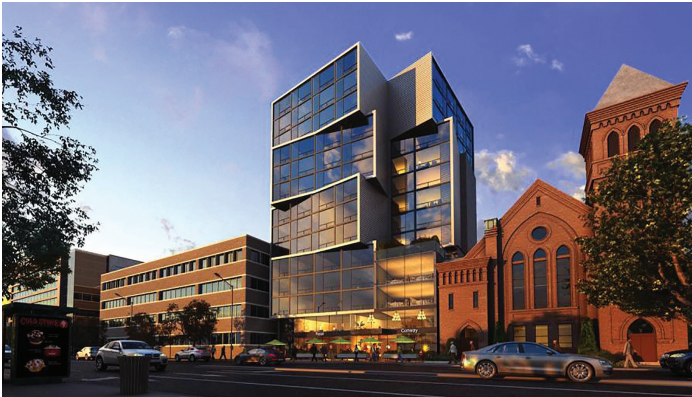
Veterans housing in Washington, DC

The HUD-Veterans Affairs Supportive Housing (HUD-VASH) program combines Housing Choice Voucher (HCV) rental assistance for homeless veterans with case management and clinical services provided by the Department of Veterans Affairs (VA). VA provides these services for participating veterans of all ages at VA medical centers (VAMCs) and community-based outreach clinics.